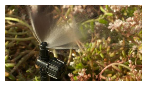
Spray pattern 180° jet

See above for spray pattern of the 360° jet.