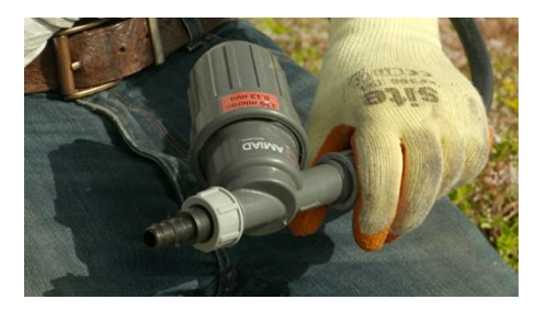
10 Filter system (optional)

Connect to your water source: insert your 16mm pipe directly into your tap connection (filter optional).