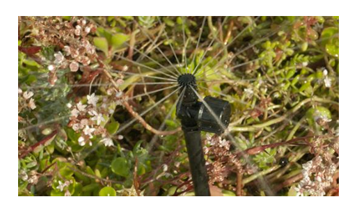
Spray pattern 360° jet

Clips can be used on the outside of the piping to fix it to something else e.g. a stopper or other connection joint. It works a bit like a jubilee clip.