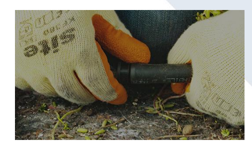
11 Terminate your system

We recommend a filter system, to be fitted between the tap and your piping, in order to prevent the jets clogging with grit or hard water.