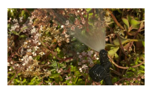
Spray pattern 90° jet

See above for spray pattern of the 180° jet.