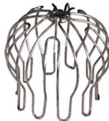
Stainless Steel Leaf Guard RO-LEAFGUARD-210-015-125-030-Z