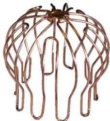
Copper Leaf Guard RO-LEAFGUARD-210-015-125-020-Z