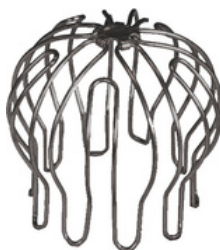
Galvanised Steel Leaf Guard RO-LEAFGUARD-210-015-125-010-Z